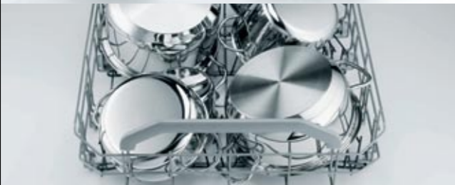
Lower rack with lowered plate-separating grates.

The upper rack has four rows of adjustable inserts for optimal loading flexibility. The new dish-separating grate can be dropped quickly, making the bottom rack totally flat to accommodate bulky dishes. Taking away the silverware basket can make room for an additional 8 plates.