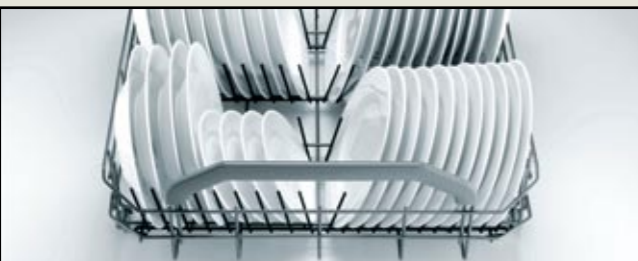
Lower rack with raised plate-separating grates.